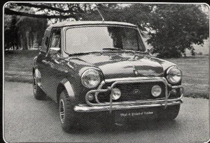
The 'Margrave' Mini Clubman